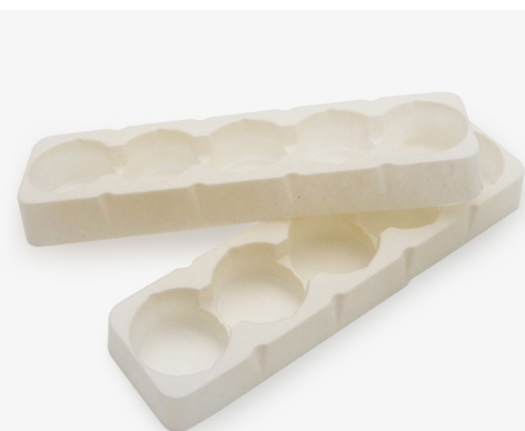
Individual deep-drawn part

DO YOU HAVE QUESTIONS? WE ARE HERE TO HELP!